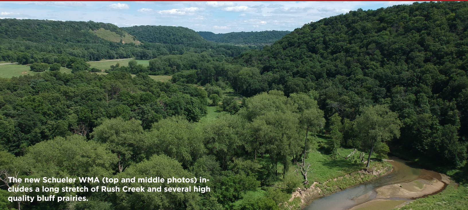
The new Schueler WMA (top and middle photos) includes a long stretch of Rush Creek and several high quality bluff prairies.