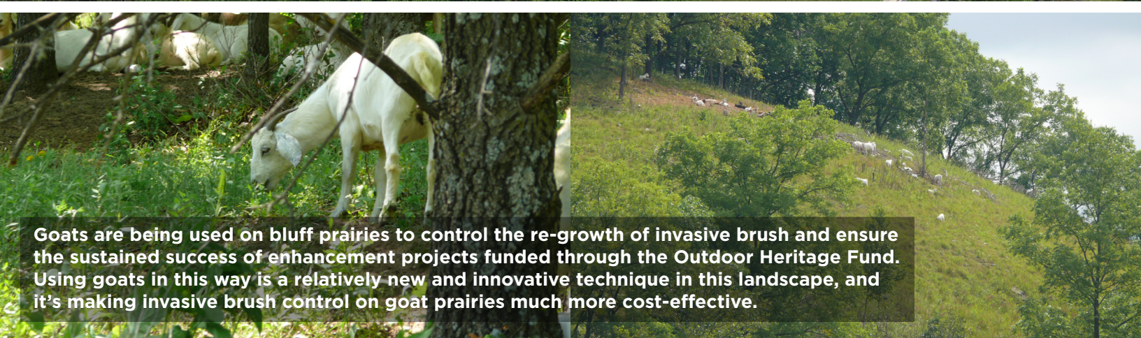
Goats are being used on bluff prairies to control the re-growth of invasive brush and ensure the sustained success of enhancement projects funded through the Outdoor Heritage Fund. Using goats in this way is a relatively new and innovative technique in this landscape, and it's making invasive brush control on goat prairies much more cost-effective.